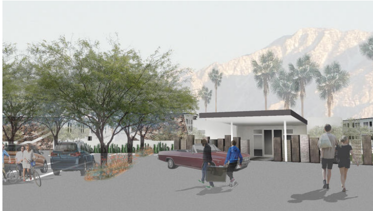
Low-slung buildings of the newly remodeled V Palm Springs hotel are depicted in an artist's rendering. (Surface Design)

Each room has a work desk and private balcony or patio with porch-style swings. Common areas include a poolside bar, 70-seat restaurant and a fire pit, all within the backdrop of the San Jacinto Mountains.